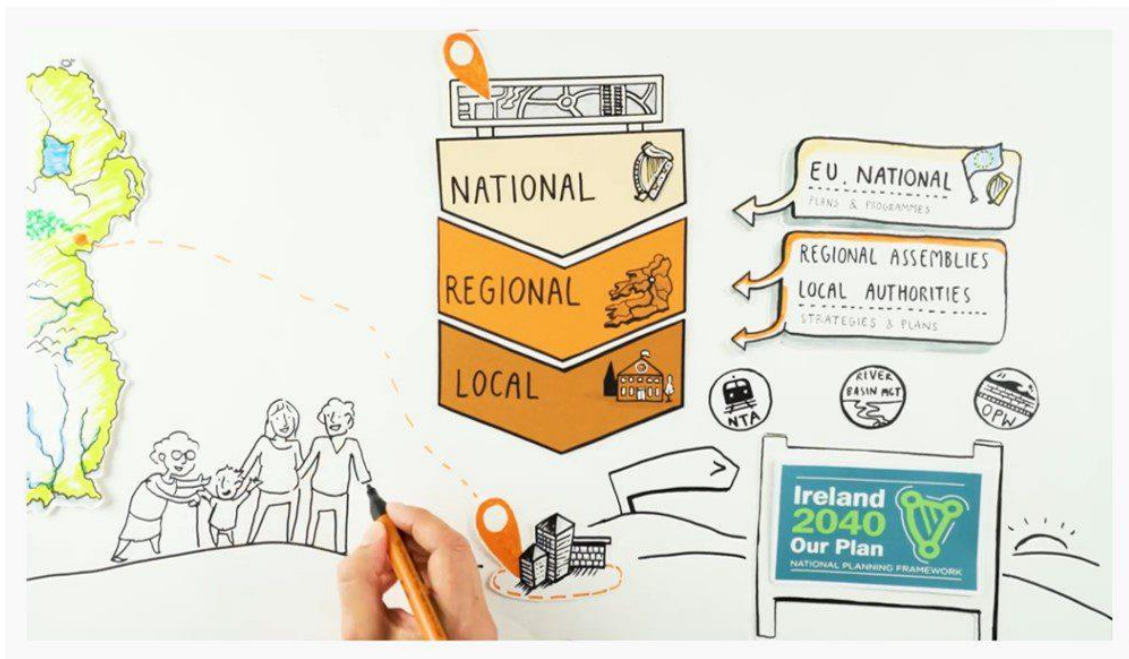
Image: Caption of the good practice video by EPA-Ireland.